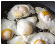
87 Yr Old Trainer Shares Secret