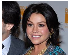
9 Celebs You Never Knew Were