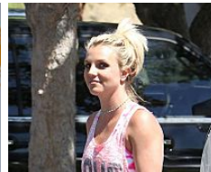
21 Celebrities Caught Doing The